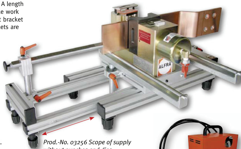
Prod.-No. 03256 Scope of supply without punches and dies